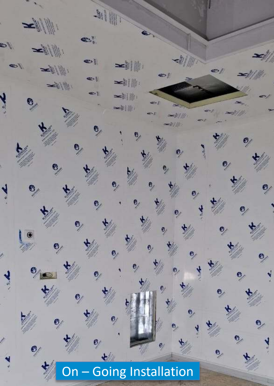
On – Going Installation